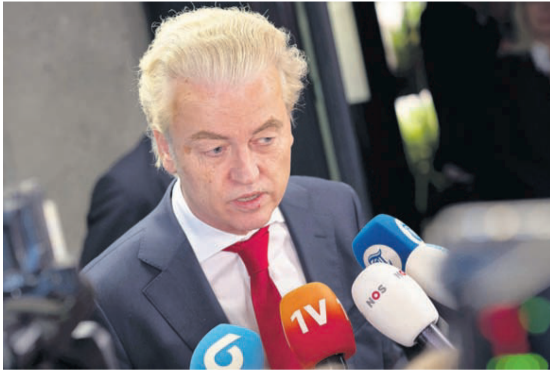
Geert Wilders, leader of the far-right party PVV, or Party for Freedom, talks to the media after a meeting with speaker of the House Vera Bergkamp, two days after Wilders won the most votes in a general election, in The Hague, Netherlands, on Nov. 24, 2023.

While it now looks like Wilders will not lead the government, he and his Party for Freedom will remain the driving force be-